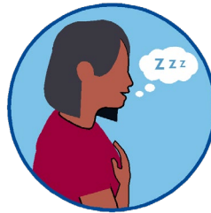
Feeling very tired