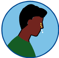
Runny nose/nasal congestion