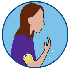
Muscle aches/joint pain