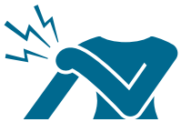
Arm pain, redness or swelling